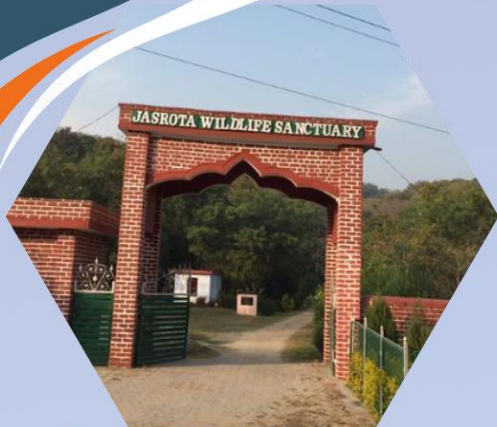
Jasrota Wildlife Sanctuary