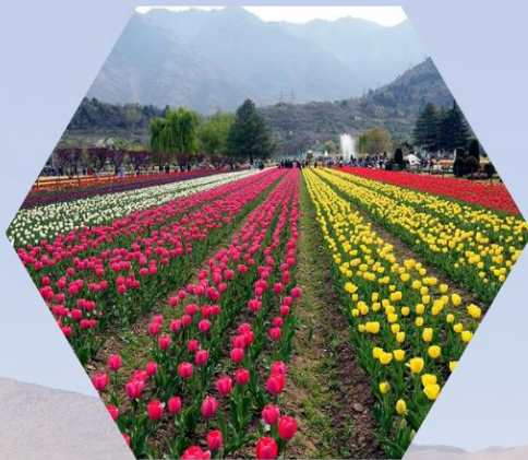
Tulip Garden, Srinagar