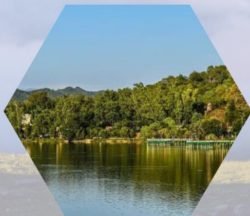
Surinsar-Mansar Wildlife Sanctuary