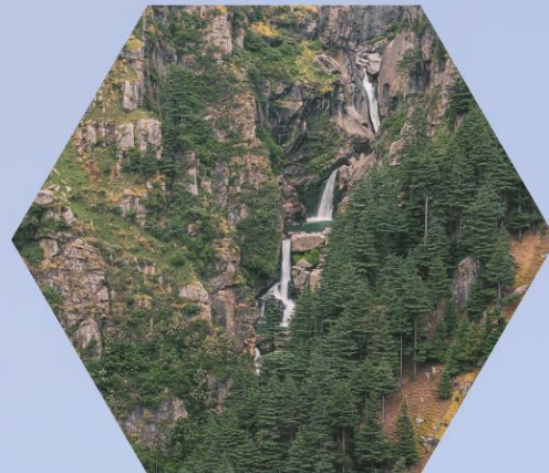
Seven falls, Bani