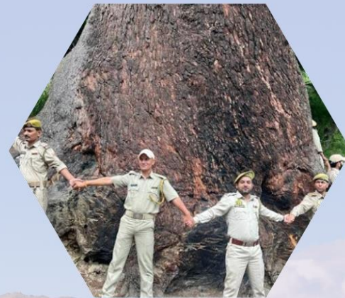
Oldest Cedar Tree in Kishtwar