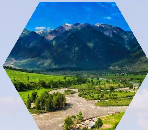
Kishtwar National Park