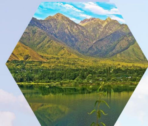
Dachigam National Park