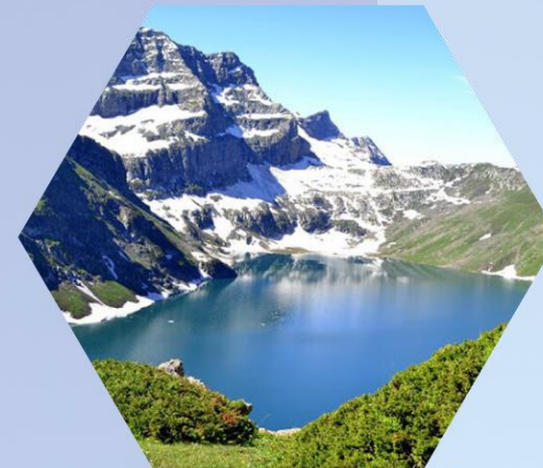
Tarsar Marsar Trek